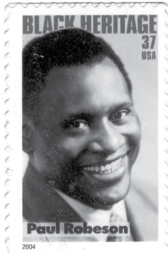
U.S. postage stamp commemorating U.S. singer, actor, athlete, and civil rights activist Paul Robeson, who because of his communist ties, was more popular in Europe than in his homeland.

The September 11 events inspired a new wave of pro-U.S. attitudes within Russia. However, sympathy for the American people as victims of this terror soon became combined with disapproval of the aggressive actions of the U.S. government—both actions taken two years before September 11 (in Serbia) and actions taken two years after September 11 (in Iraq). Research conducted in Rus-