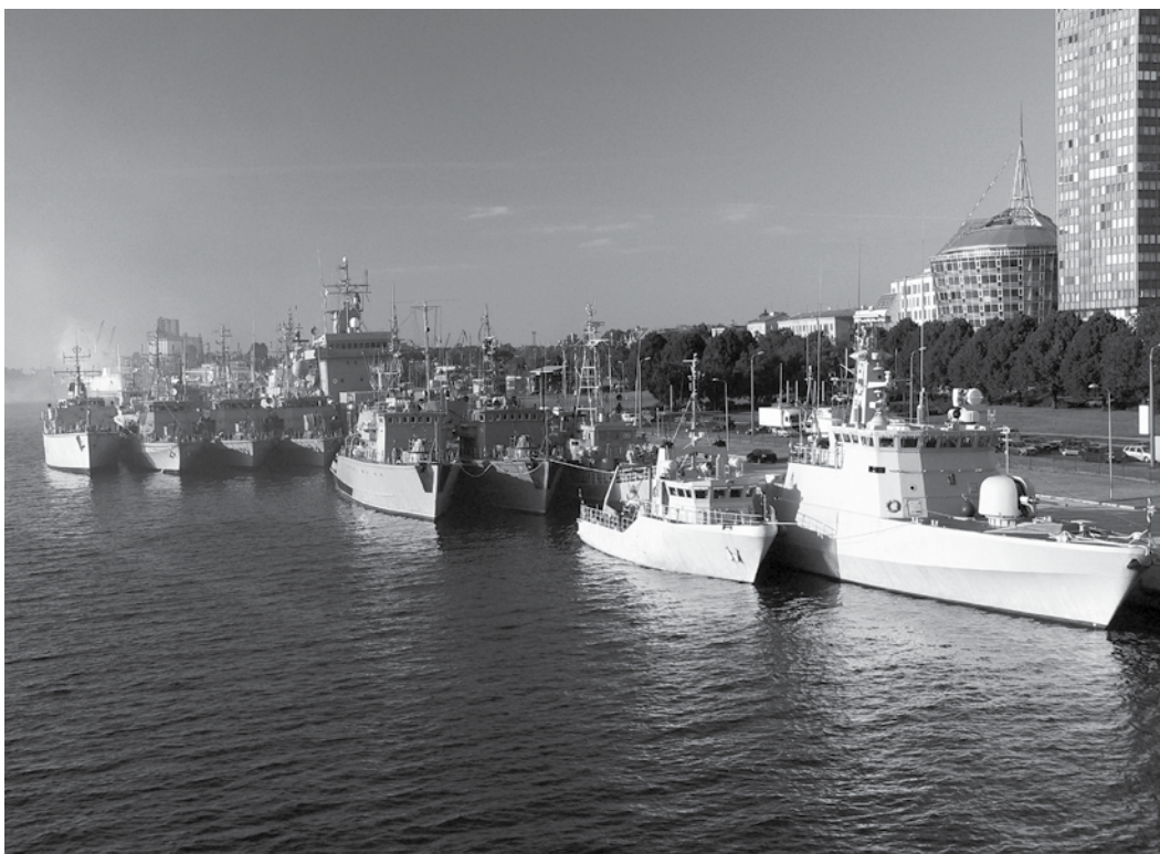
A Russian fleet in the harbor of Riga, Latvia. With the demise of the Soviet Union and the end of the Cold War, Russian influence waned in nations like Latvia, opening up the opportunity for closer relations with the U.S.

The terrorist attacks of September 11, 2001, moved Russia toward rethinking its relationships with the United States. President Putin's administration proposed to the United States mutual cooperation in the area of intelligence data exchange and offered a limited opening of Russian air space to U.S. aviation, when necessary, as well as support for U.S. military actions in Central Asia, including Afghanistan. He also offered to act as a mediator between the United States and some of the Central Asian states. In return, the United States welcomed Russia as a member of its antiterrorist coalition and granted it a special status in recognition of its important role in Asian politics and the respect accorded it by most Muslim and Central Asian states. September 11 made both countries recognize their common enemy—terrorism—and